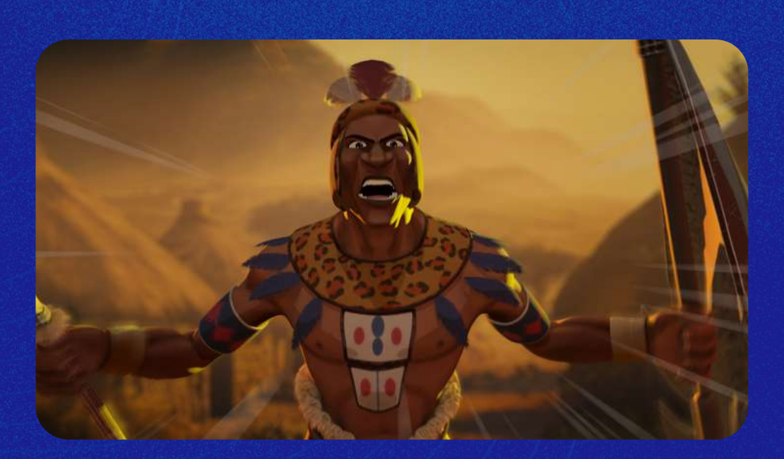
School of Game Design & Development