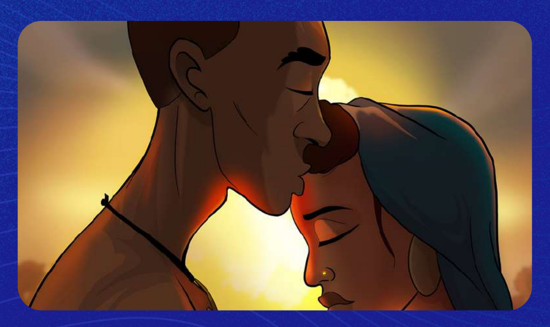
School of 2D Traditional Animation