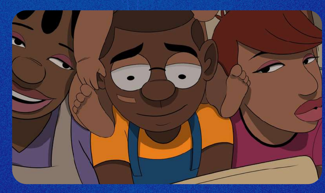
School of 2D Cut-Out Animation