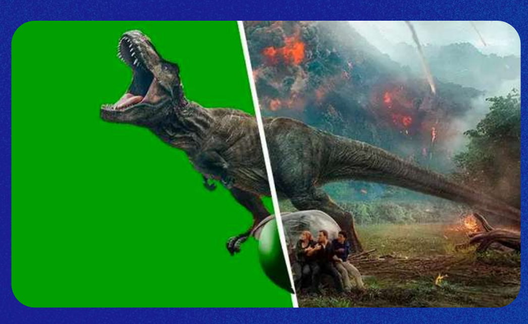
School of CGI & VFX