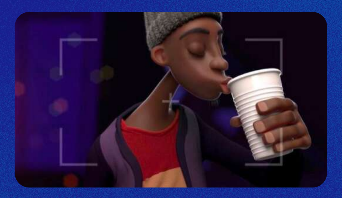
School of 3D Animation