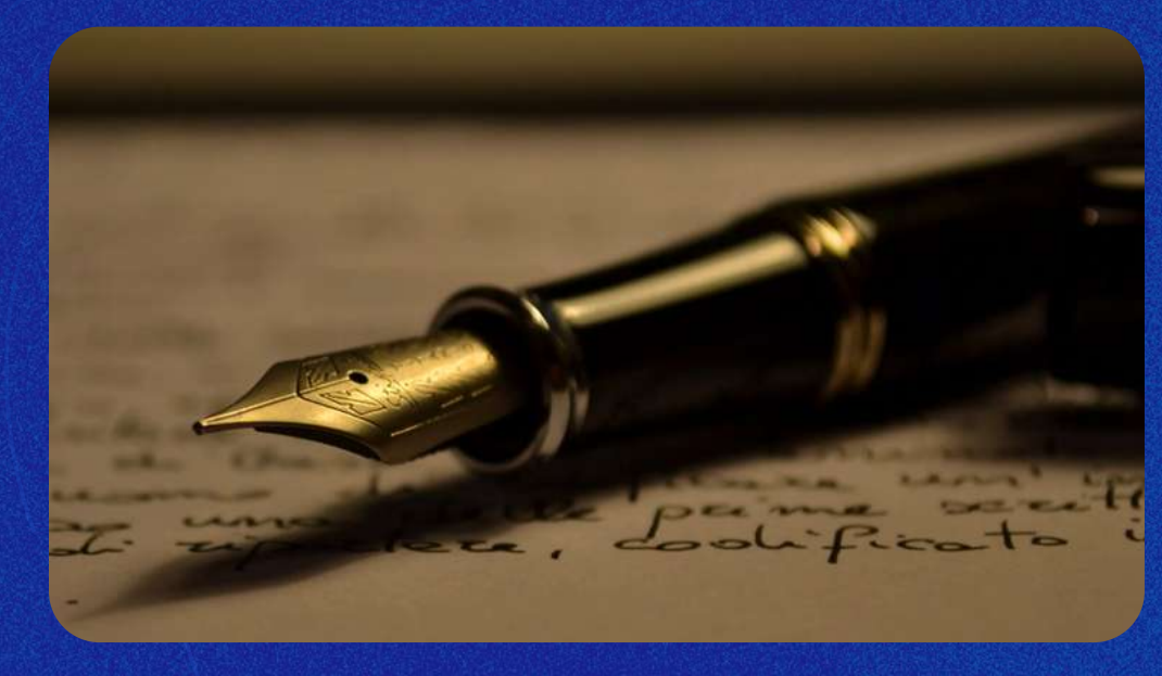
School of Story & Scripts Development